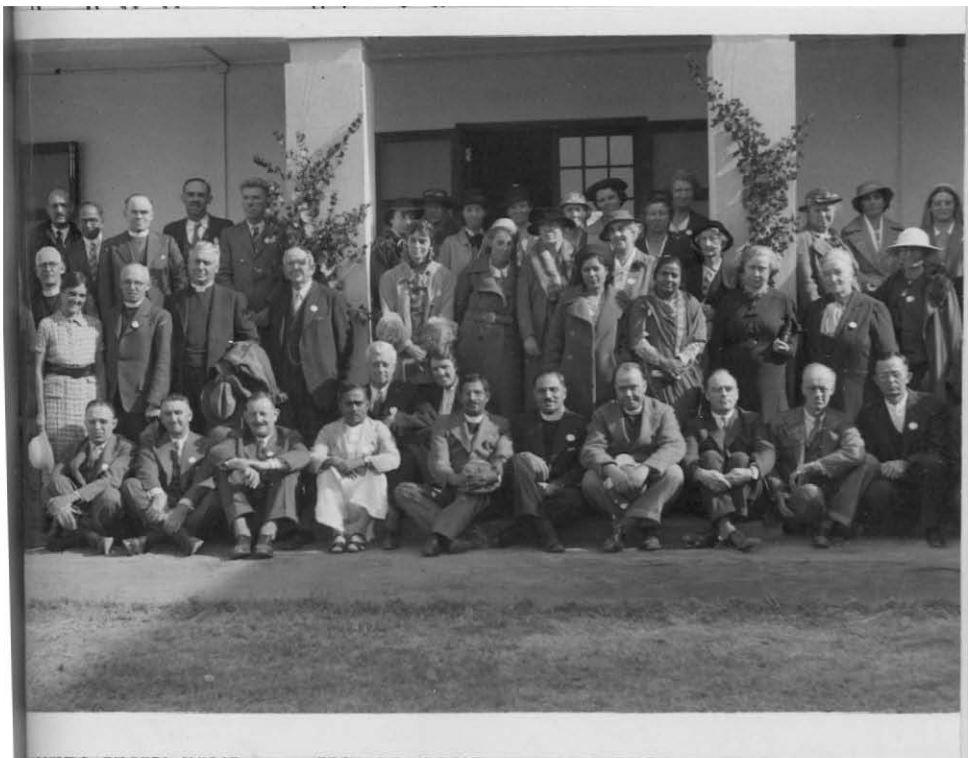
Conference of Missionaries to Muslims Y. M. C. A. New Delhi, Dec., 1938.