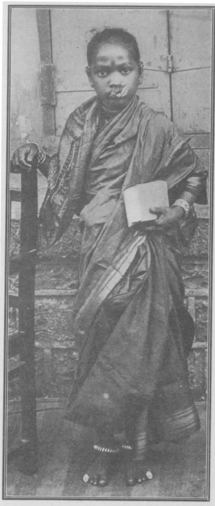
A MAHAR GIRL OF INDIA A type of one of the deprest classes

ing famine, the new Hindu sects are organizing and conducting famine campaigns. Their idea is to help their