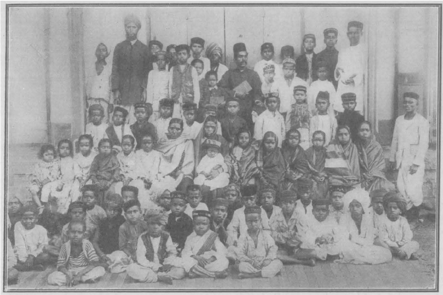
A HINDU MISSION SCHOOL FOR DEPRESSED CLASSES AT FAREL, INDIA

stan to give more attention to reforming his social institutions himself, instead of trusting to charitably inclined foreigners to do this vitally essential work for him. Since self-help is the best help, the missionary, by stimulating the East Indian to help himself, has rendered India the most enduring service.