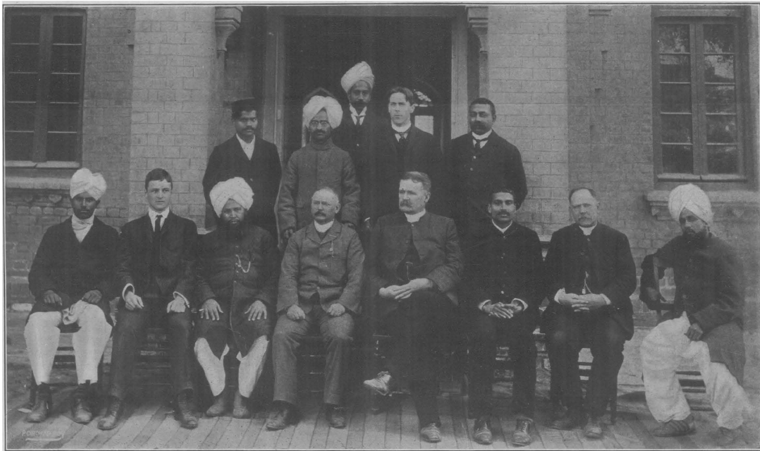
From The Assembly Herald