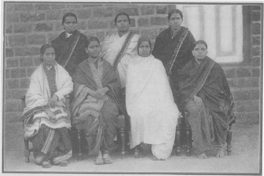
SOME HINDU WORKERS IN THE HINDU WIDOWS' HOME AT POONA

Undoubtedly, the relegation of more than 50,000,000 human beings to a deprest social state is a canker-sore of the most virulent type; but besides it, there are other disorders, almost