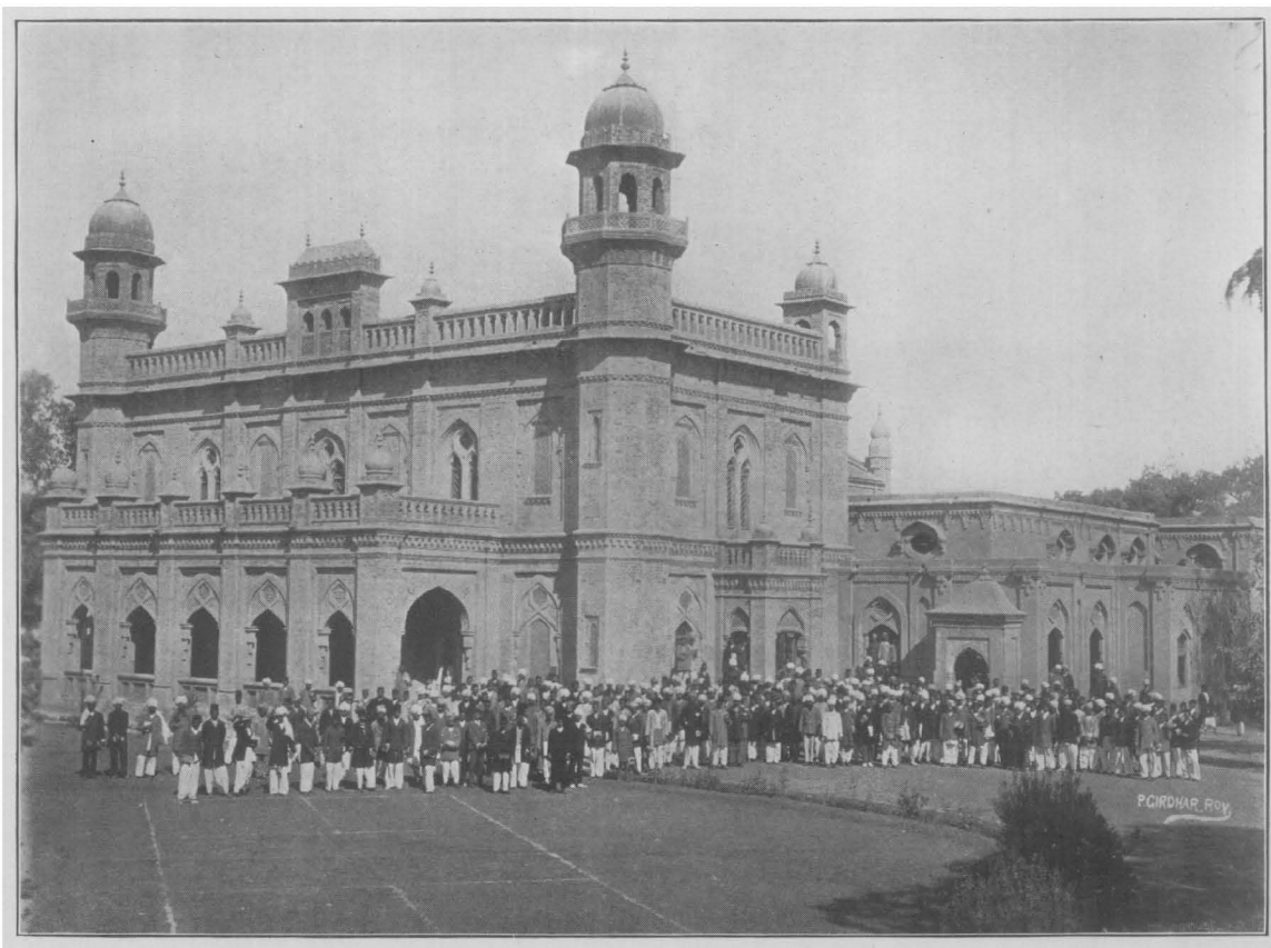
THE FORMAN CHRISTIAN COLLEGE, LAHORE, INDIA