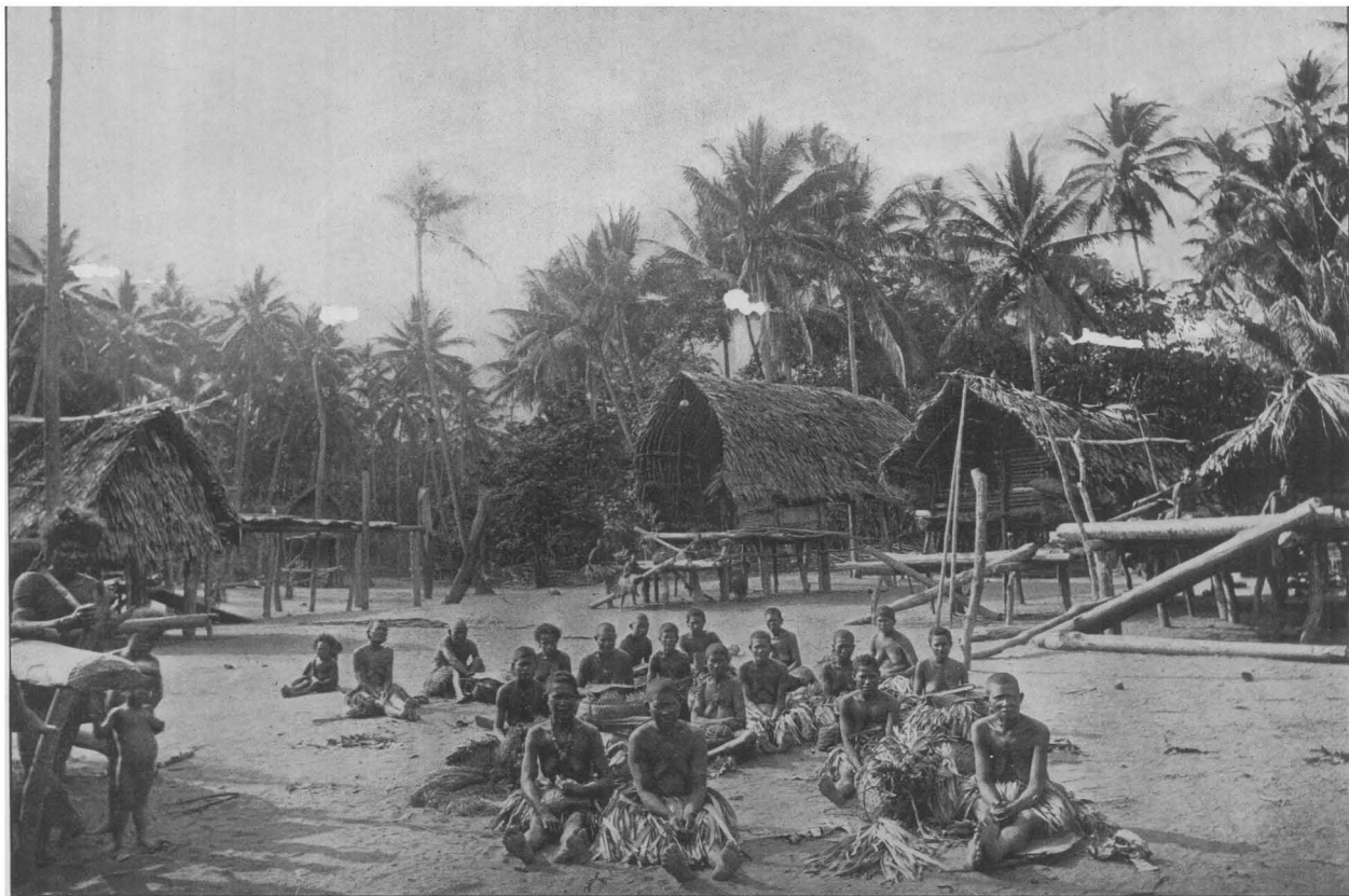
KEREPANU WOMEN AT MARKET-PLACE OF KALO, NEW GUINEA