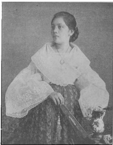
A SPANISH MESTIZO BELLE

They impressed me as naturally intelligent and kindly. Among the delightful memories of my life are receptions in Dumageute and Manila, where hundreds of well-dressed, pleasant-faced Filipinos bade us welcome with a grace which suggested a far remove from barbarism. Give these people a chance—some decades of fair treatment, of just laws, of American political and educational methods, and of a pure, Protestant faith—and I believe that they will justify the hopes of their well-wishers rather than the sneers of their detractors. Said Señor Felipe Buencamino: "The heart of the Filipino is like his fer-