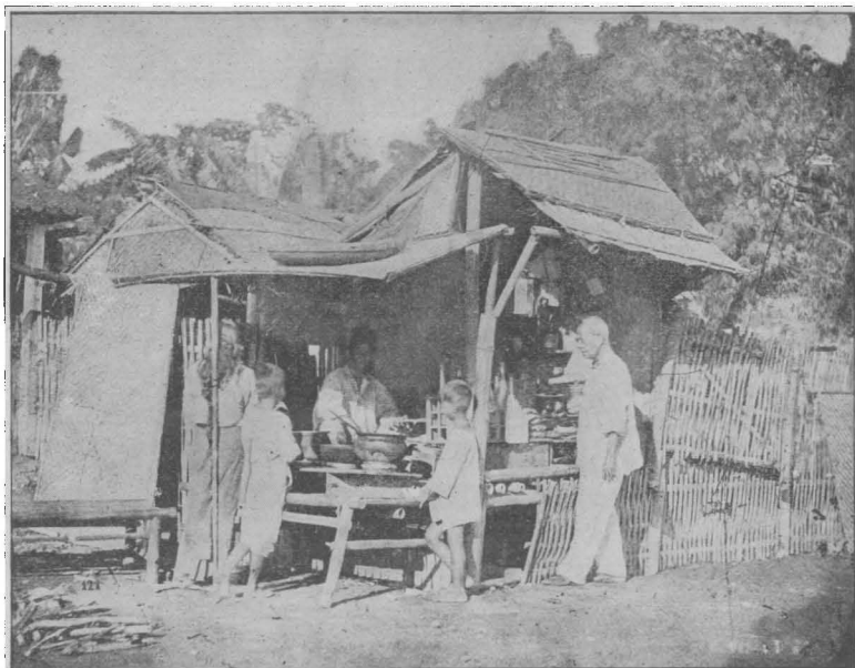
A WAYSIDE REFRESHMENT BOOTH IN LUZON

In such circumstances, life is taken more easily than by the Scotch-