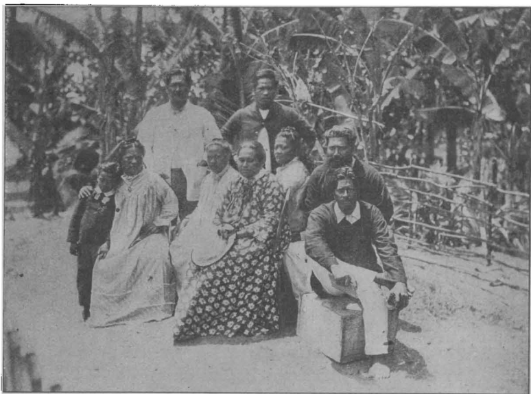
CHRISTIAN TEACHERS FROM HULA, KALO, KEREPANU, AND AROMA