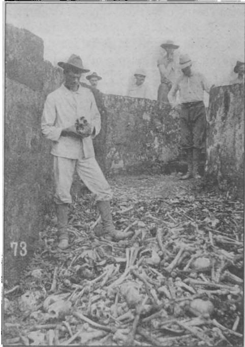
THE BONE PILE IN PACO CEMETERY The Roman Catholic Church demands rent for burial plots, and for non-payment of this high tax the remains of the dead are cast into this pit

It is useless to bring over white laborers. The American can not do manual labor in this climate. He is the product of a radically different physical environment. The sun here seems to be no hotter than in our summers at home, but it is deadly to the foreigner who continually exposes himself to it. It has a kind of "X-ray" power under which the white man inevitably succumbs in time while the perpetual mildness of the tropics saps the energy and affords no recuperation. The American in the Philippines must always be an employer, an administrator, or a teacher. He should never come expecting to earn his living as a farmer, a mechanic, or a laborer. He