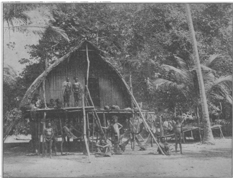
A NATIVE HOUSE AT VANUABADA, NEW GUINEA

water was evidently amusing to them, and they seemed particularly anxious to impress upon my mind that they were not seeking water at such a place. "The eakune kō, ngo nyipēti pe" (Not we , but you ). "Well," I said, "I had better go down myself and see if I can find water." One wag hinted that this might have been done from the first with very good results. However, none of them supposed that I really intended descending the well, but I insisted upon the two men coming up. I did not trust them to lower me down standing in the bucket, as they generally did, but slipped down the rope, and at once