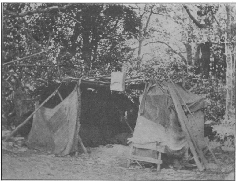
THE "HOME" OF A MAN AND HIS WIFE, NEW SOUTH WALES

And, once more, missions become a mere philanthropic enterprise. Instead of carrying a saving message to a lost world, men go to fraternize with the priests of error. Parliaments of religion displace bold assaults on heathen systems, and the one name given under heaven among men whereby we must be saved, is associated in a sort of new Olympus or Pantheon, with Jupiter and Buddha, Brahma and Confucius, Zoroaster and Mohammed.