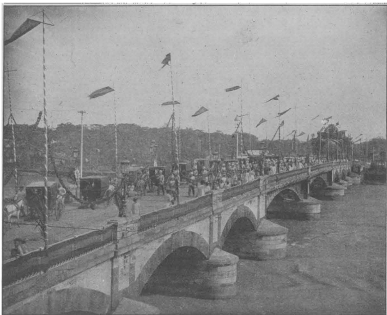
A GALA DAY ON THE PUENTA DE SPANA, MANILA

these peoples have been affected at every point by the movement in question; how profoundly their laws, institutions, mental and moral training, ways of judging conduct, and habits of thought have been influenced for an immense number of generations in the course of the development through which they have passed, we shall at once realize that it would be irrational and foolish to expect that any individuals, or classes, or all the individuals of a single generation, should have the power to free themselves from this influence. We are, all of us, whatever our individual opinions may be concerning this movement, unconsciously influenced by it at every point of our careers and in