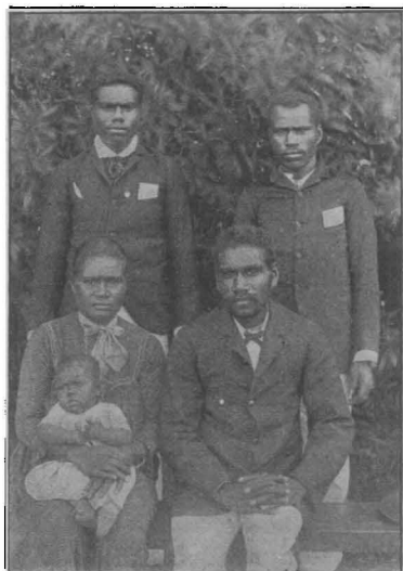
CHRISTIANS IN NEW GUINEA