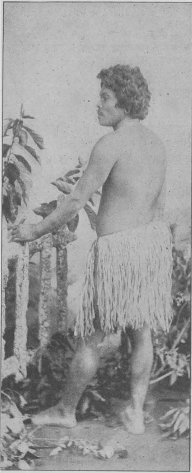
A NATIVE OF MINDANAO

They are not inherently degraded or vicious people. For uncounted centuries their women have been creatures of men, and if they easily yield to the soldier and the priest, it is not so much because of a lascivious disposition as because they have never been taught to have a conscience on the subject or to feel that it was possible for them to resist anything a man may desire. Their Church, which should have inculcated loftier standards, put a premium upon concubinage by refusing to perform the marriage ceremony except for exorbitant fees. I heard of one case where the priest extorted $200, Mexican, from a family in only moderate circumstances. Nor was this an exceptional case. In such circumstances it is not surprising that many couples lived together without wedlock, especially as