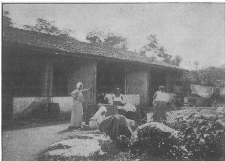
SOME NATIVE HOUSES AT MANAOS, BRAZIL

Each section is a separate dwelling. The women in front include one Indian, two negroes, and one of mixed race