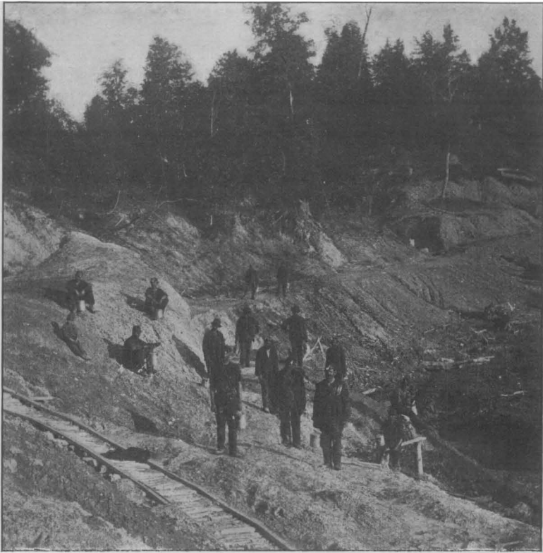
MINERS AT THE NOON HOUR

fiddler who plays for us—say, wot's a fellow livin' for—all work? Some of us ain't got no wives, and them that has—oh, say! story-books is all right for love stories, but I've seen enough of that sort o' business among the miners, an' I know better'n blamin' the fellows wot don't go home."