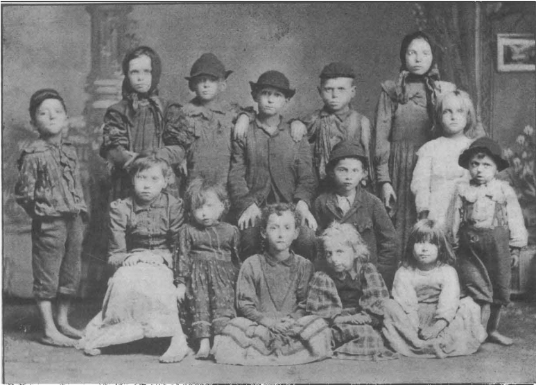
A GROUP OF MINERS' CHILDREN

wives who would do personal work among the men, live among them, and open places to which they could resort, so as to break the dull monotony of work, would do more good than by any other agency and method. The true reformer must be an individual seeker, and his "personal work" must not consist merely in teaching, but must also be full of brotherly sympathy, free from bigotry and cant, ready to concede a point often, willing to be patient, ready to look at things from the other man's point of view, and full of the love such as Jesus had when He had compassion on the multitudes. Nor is it only the coal-miners that need the light of the Gospel. The spirit of recklessness and the lack of moral character that pervades the coal-pit finds