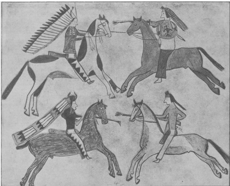
from a drawing by an Indian artist