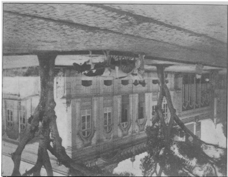
A MERCHANT'S RESIDENCE AT PARÁ, BRAZIL