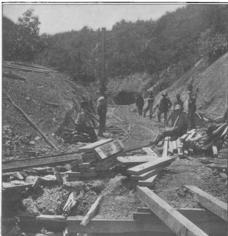
AT THE MOUTH OF A COAL-MINE