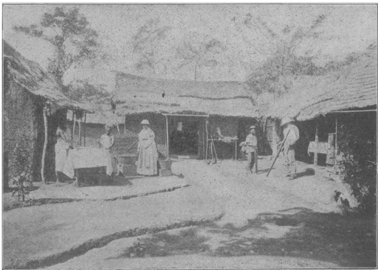
A SCENE IN THE MISSION COMPOUND, KUMASI, ASHANTI LAND.

and an organized attempt is to be made to recover it. This royal relic consists of a wooden frame with gold plates rendered black by human blood, for every time sacrifices were made it was dipped in blood. The stool was more than one hundred years old, and when repairs had been necessary these had been carried out by affixing strips of gold, with which the stool was now nearly covered, while there was also upon it two chains of massive gold. The king, at his coronation, sat on the Golden Stool at the great festival, but only for a few minutes, and that was the only time in his life. The stool was the emblem of power and loyalty, and doubtless, after some years of