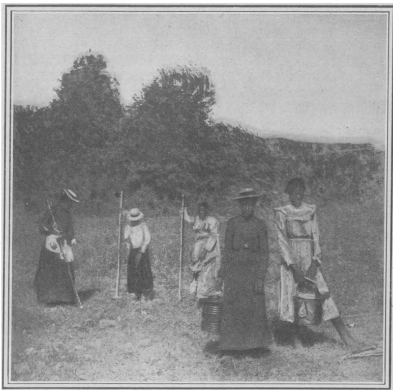
GIRL PRISONERS IN ALABAMA.