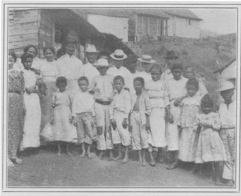
A GROUP OF PUERTO RICANS NEAR YAUCO.

The climate is equable. The range of the thermometer is very small. In New York it is more than a hundred degrees; in Puerto Rico scarcely thirty. It is never extremely hot. The mercury seldom