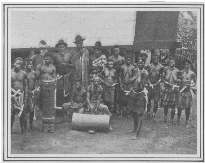
HEATHEN DANCERS OF THE FANG TRIBE, GABUN, WEST AFRICA.

These men and women are cannibals arranged for an immoral heathen dance. Their musical instruments are two drums, which are also used as signal drums in time of war.