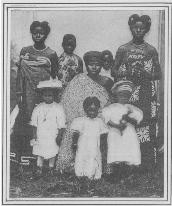
A CIVILIZED FAMILY IN WEST AFRICA.

entire southern third of Africa, and speaking the dialect of any one of its tribes, could, in a few months after removal to any other tribe, speak the dialect of that tribe. Any missionary of university education and of ordinary diligence, can, within a week after his arrival at his station, read (of course, in a parrot fashion) the native language, and thus be able to conduct a religious service with Bible and hymn-book. If he does not do that within one month, I would regard him, if not incapable, as open at least to the charge of unfaithfulness and lack of diligence. One who will promptly on arrival, and with