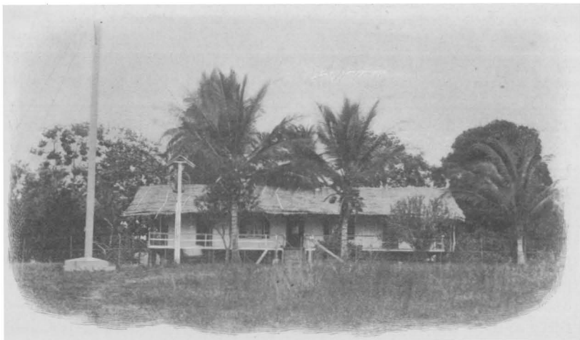
THE MISSION HOUSE, LIBREVILLE, GABUN, WEST AFRICA.

Why East and West Africa are avoided by tourists, I do not know. Perhaps because we can show no gems in architecture, no magic of music, no grace of art, no monuments of the past; perhaps because