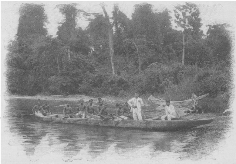
A NATIVE CANOE ON THE OGAWAI RIVER, WEST AFRICA.

their children to go. The foreign board itself was so far influenced by this public opinion that it rarely took the responsibility of asking the theological seminarians to go to Africa, much less of turning their thoughts thither from other fields. In the case of other missions, candidates for foreign missionary service were turned aside from one field at the call of special necessity in another, e. g. , for China as against India, or for India as against Syria, or for Syria as against Persia, etc. But rarely from any one of these countries for Africa. She got only those who offered for her. If they succeeded in escaping, overcoming, or disregarding the opposition of relatives and acquaintances, they themselves assumed all responsibility of taking