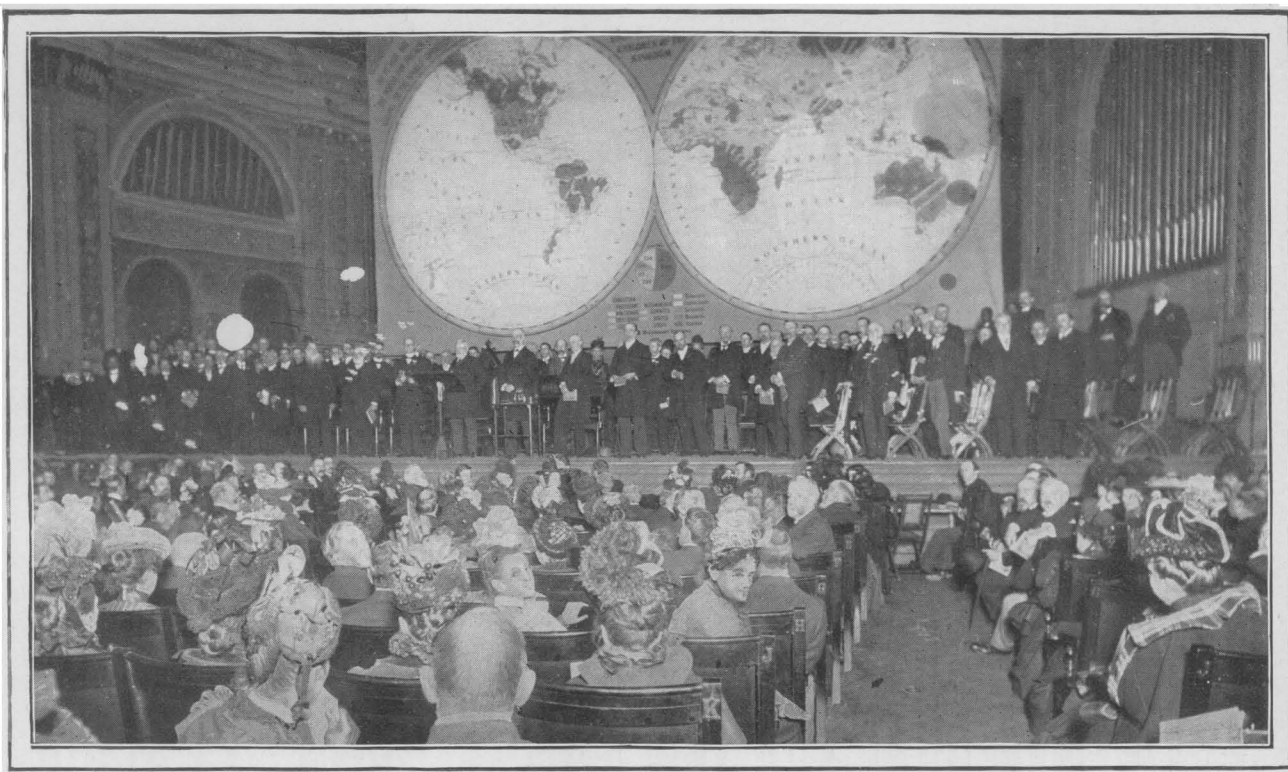
Photographed for the New York Tribune.