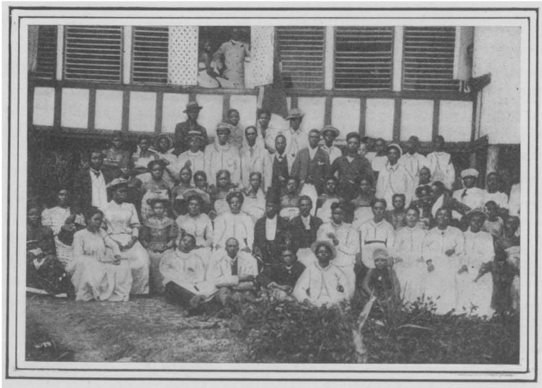
A CHRISTIAN MARRIAGE IN LIBREVILLE, GABUN, WEST AFRICA.

Third.—Missionaries in Africa are off the line of the world's travel, and thus fail to obtain the interest and cooperation which arise from intelligent acquaintanceship. Only four classes of persons go to the east and west coast of Africa. (The northern and southern ends,