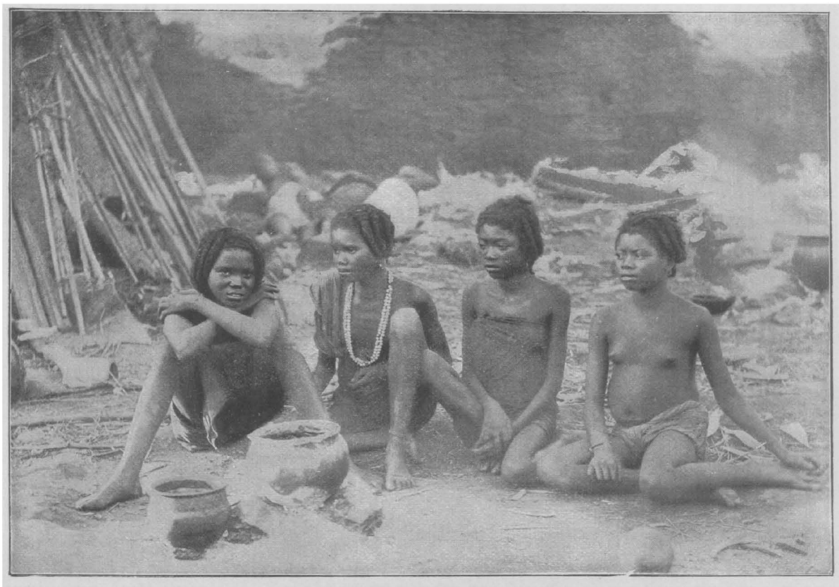
A GROUP OF AFRICAN SLAVE WOMEN.