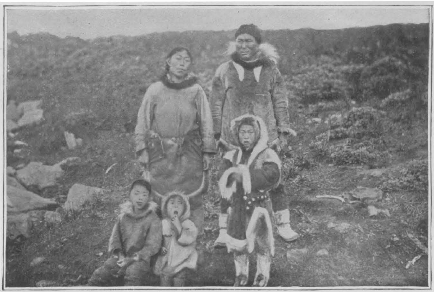
AN ESKIMO FAMILY, CAPE PRINCE OF WALES, ALASKA.