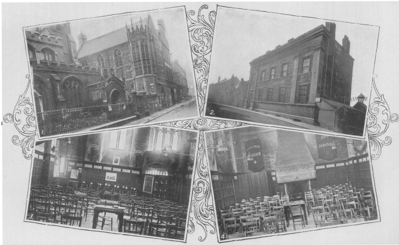
HENRY MARTYN MEMORIAL HALL, CAMBRIDGE. HENRY MARTYN MEMORIAL HALL (interior).