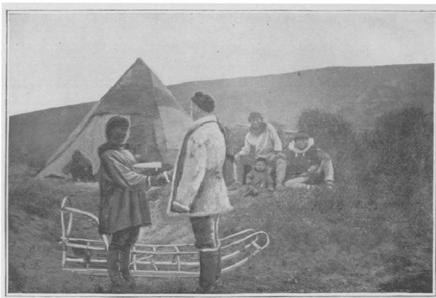
AN ESKIMO SHOWING BY PANTOMIME THAT HE WOULD RATHER STAB HIMSELF THAN INJURE THE MISSIONARY.