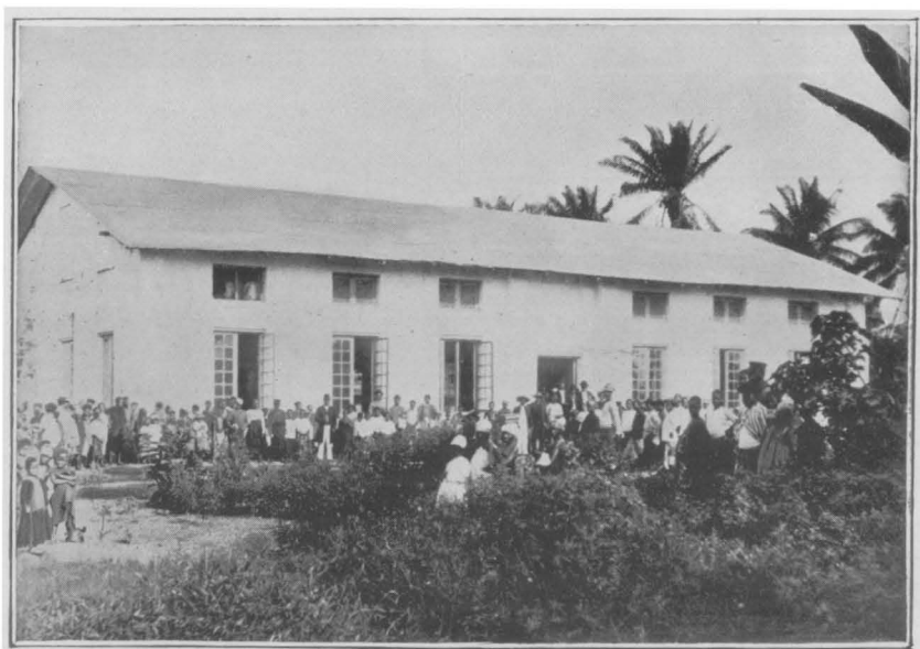
THE BAPTIST CHURCH AT KAMERUNS, AFRICA.

This church is entirely independent and maintains twenty-seven outposts. The bricks were made and the building erected entirely by native Christians.