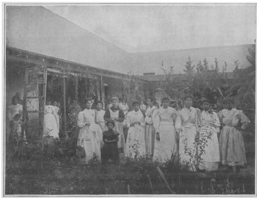
GIRLS' SCHOOL, PRESBYTERIAN MISSION, SALTILLO, MEXICO.