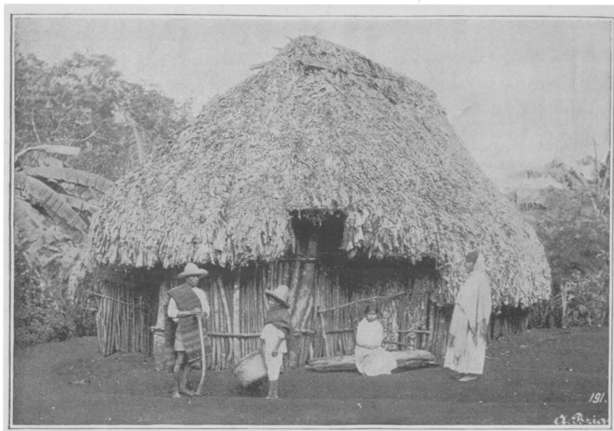
NATIVE HUT NEAR CORDOVA, VERA-CRUZ, MEXICO.