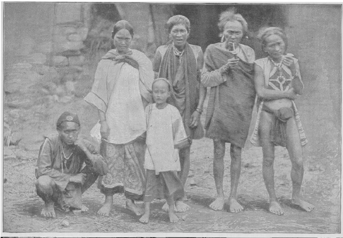
From "From Far Formosa."

UNSUBDUED ABORIGINES LIVING IN THE MOUNTAINS.