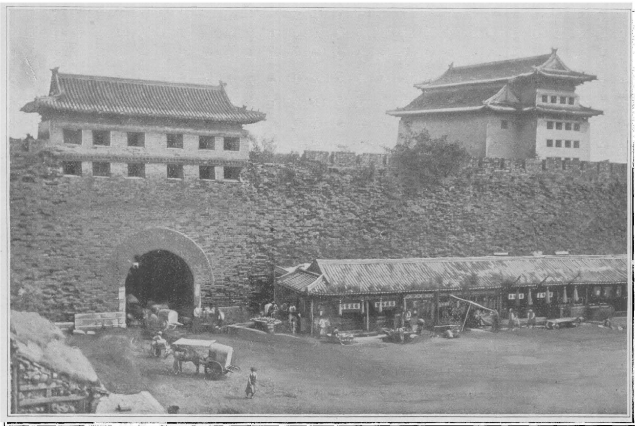
THE INNER EAST GATE OF PEKING.

Peking has a double wall each of which has sixteen gates surmounted by towers. The space between the walls, several acres in extent, is supposed to be kept free for military purposes; but a few small shops have found foothold within it.