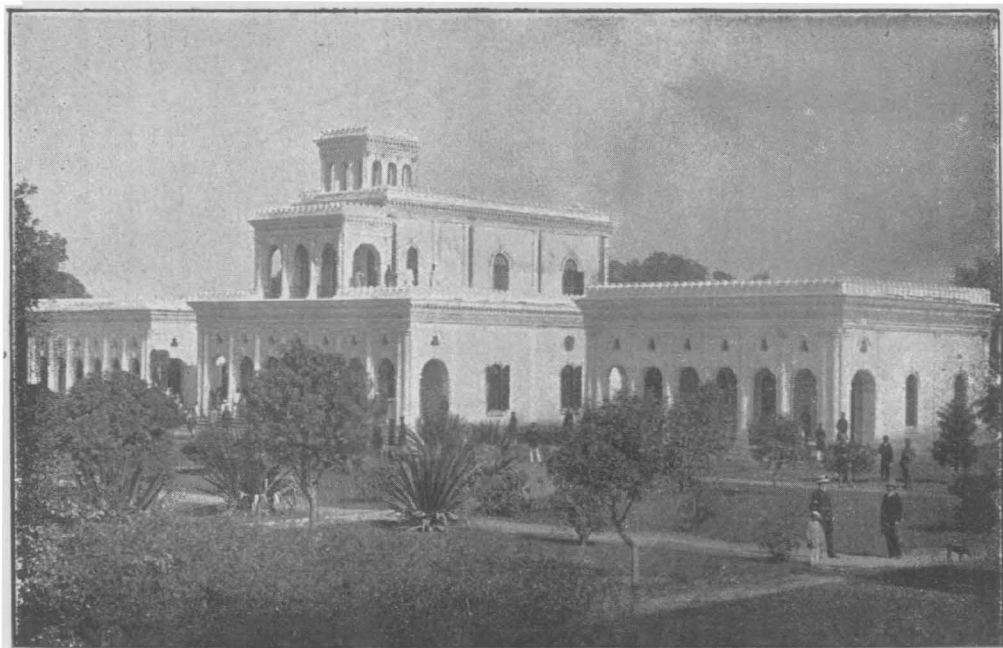
THE BAREILLY THEOLOGICAL SEMINARY, INDIA.