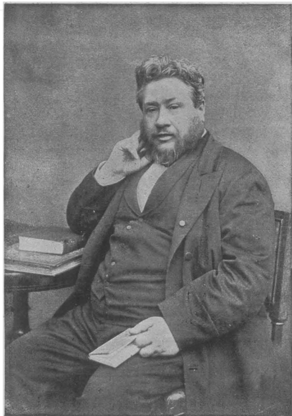
CHARLES HADDON SPURGEON.