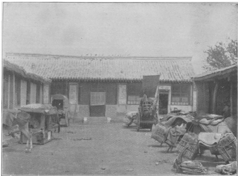
CHINESE INN, ON THE ROAD TO KALGAN.