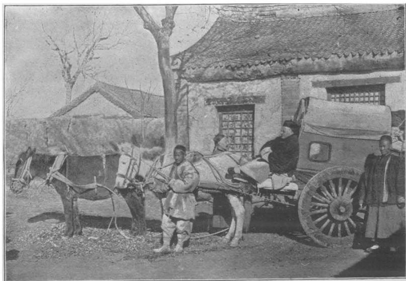
MISSIONARY IN NORTH CHINA STARTING ON A TOUR.