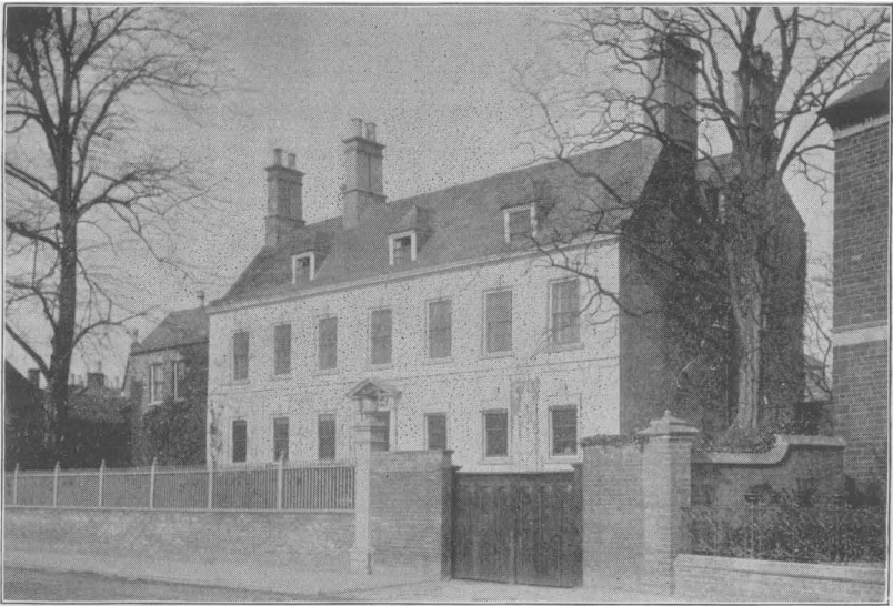
WIDOW WALLIS'S HOUSE AT KETTERING. (WHERE THE BAPTIST MISSIONARY SOCIETY WAS FORMED.)