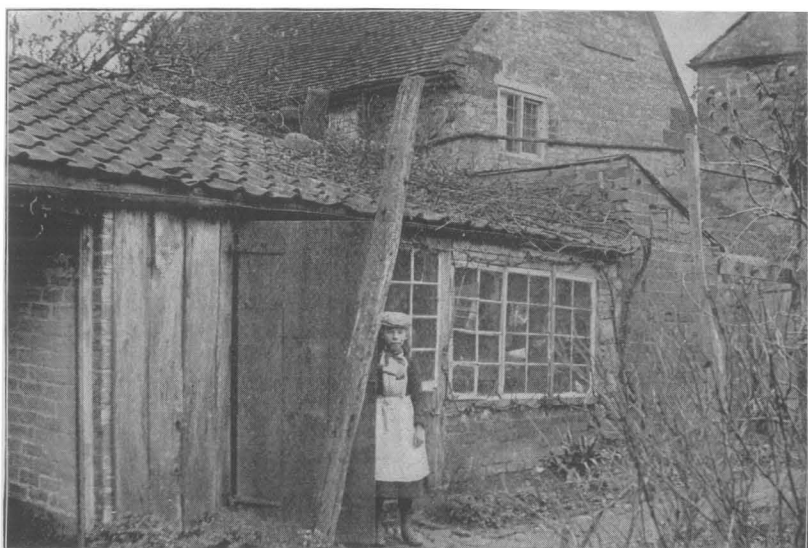
CAREY'S SHOE SHOP AT HACKLETON.