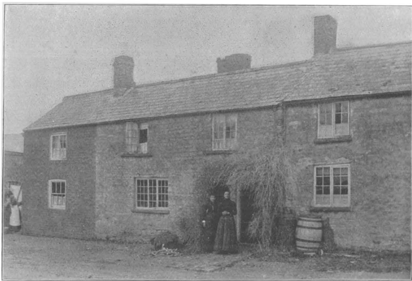
THE HOUSE WHERE CAREY LIVED.