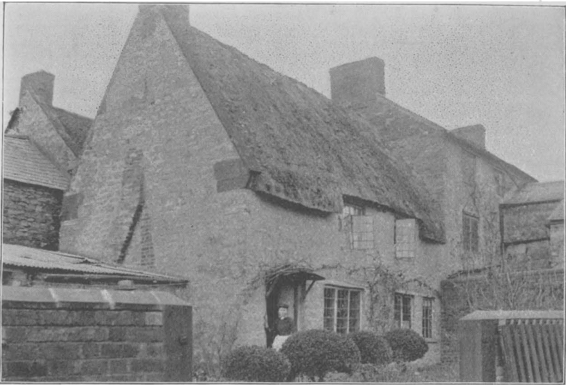
THE OLD CHAPEL AT HACKLETON. (NOW USED AS A DWELLING.)